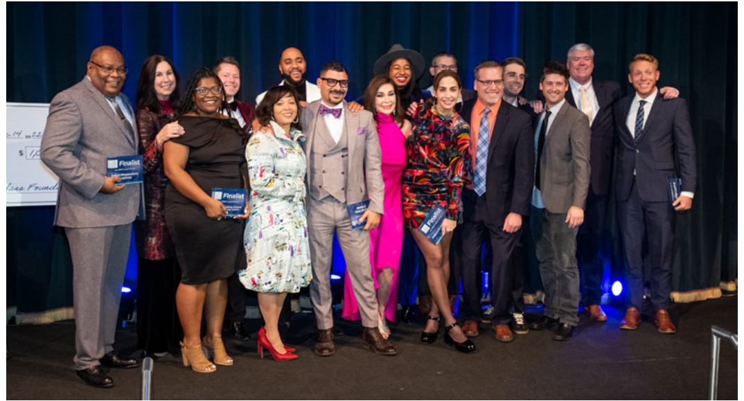
The 2021 and 2022 Yass Prize Finalists

Transformational education can happen in traditional looking or new forms of public, private and charter schools. Learning happens individually, online, on the ground in small groups, formally, informally. It happens via tech, experiential programs, and much more. The power of integrating all sectors reveals more similarities than differences, and the expansion of education opportunity multiplies. We've seen it happen widely among Yass Prize winners. And we will seize every opportunity to magnify and grow exceptional education opportunities, no matter what the provider type or definition.