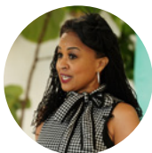
TEE WILSON Beyond Excellence Academy of STEAM , Independent School for Girls in Tennessee 2025 Semifinalist

“It’s days of being immersed in what’s possible in education when you stop trying to fit children into systems and start designing schools around them.”